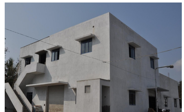
RO building at SIDCO II CETP