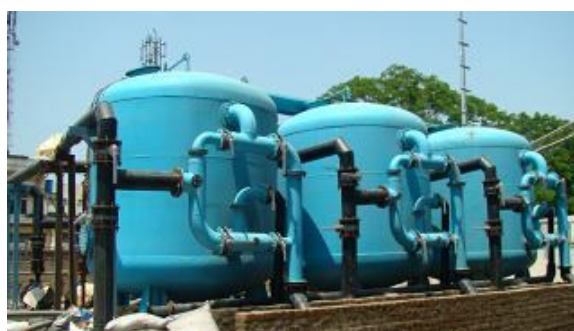
Multigrade filters at PTIETC CETP, Pallavaram