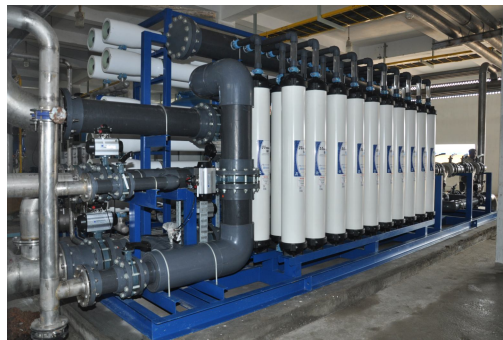
UF modules erected at Ranitec CETP, Ranipet

The Dintec CETP project is yet to kick off, however the system at Dintec would be ready by December 2012, subject to DIPP releasing the first installment without any delay.