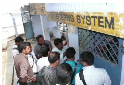
At effluent flow metering in K.R. Leathers

The participants expressed that the study tour had been very useful for the visitors and the team would like to implement the best practices learned during the study tour in their factories.