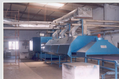
Solar hot air application in a tunnel drier of an autospray