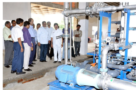
Site visit to Ranitec CETP, Ranipet