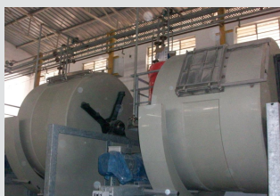
Drive system in drum is an important area that improve energy saving

Process economies such as Reducing number of washings and combining unit processes, reduces the energy consumption