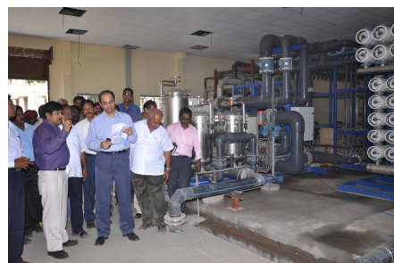
Site visit to SIDCO I CETP, Ranipet