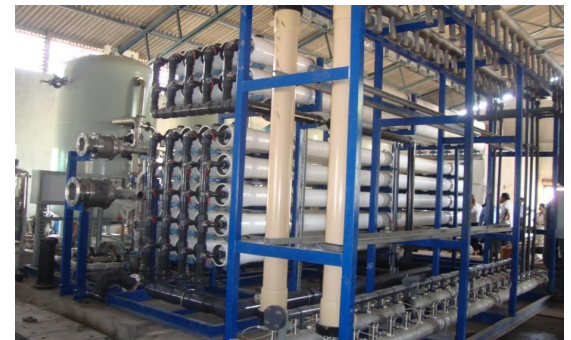
RO modules erected at SIDCO I CETP, Ranipet