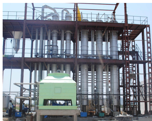
Evaporator at Pertec CETP, Pernambut